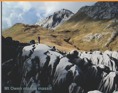
Mt Owen marble massif