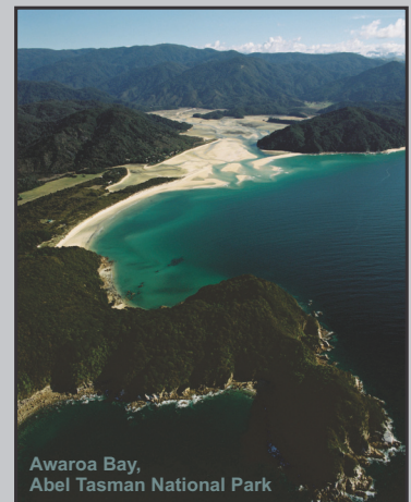
Awaroa Bay, Abel Tasman National Park