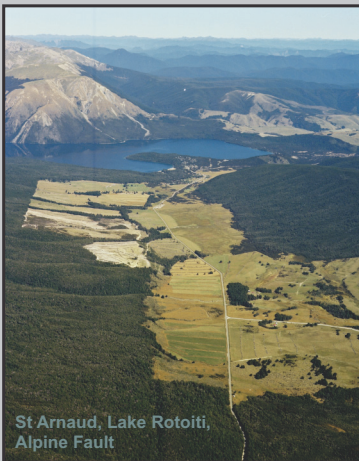
St Arnaud, Lake Rotoiti, Alpine Fault